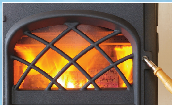
New stoves are available in many sizes and styles. Look for the EPA label on the back that indicates it is certified.

The U.S. Environmental Protection Agency (EPA) recommends replacing old wood stoves with modern heating appliances. This can reduce smoke and dust, as well as cut heating expenses. Making the switch can also help make your home healthier and safer. There are many cleaner-burning options, ranging from gas to high-tech wood stoves certified by EPA.