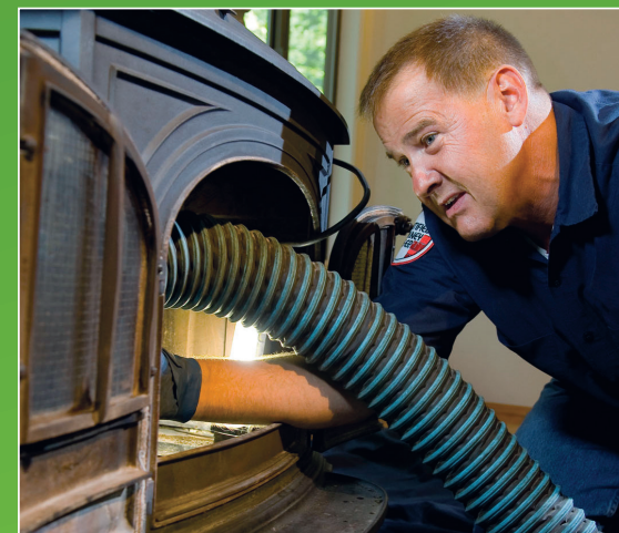
Stoves and chimneys should be inspected by a certified chimney sweep once a year to prevent chimney fires.

Improperly installed stoves or chimneys can spill smoke back into your home or cause a house fire. A hearth specialty retailer can arrange professional installation by a trained technician or one certified by the National Fireplace Institute.®